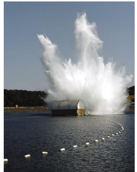
Shock qualification barge test of the VIRGINIA class Weapon Handling Module.