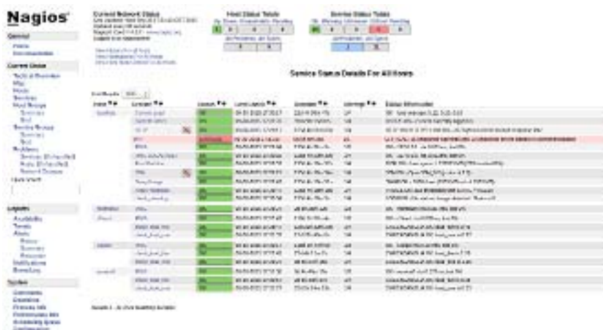
Figure 11-1 A Critical SGI MPT Message in Nagios

Figure 11-1 on page 117 shows how an SGI MPT message appears in the Nagios interface.